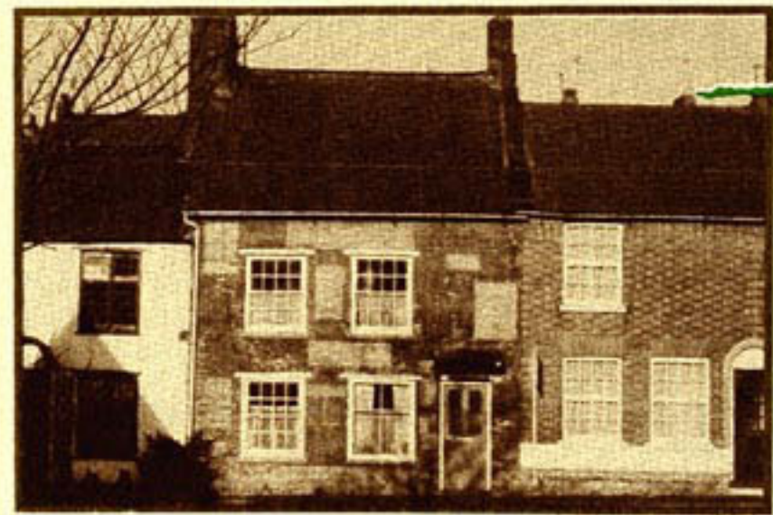
22, 24, 26 High Street

The origins of Manor Road and High Street go back to early mediaeval times, before King John discontinued direct Royal control of the township. The layout of this early settlement was typical of many Northamptonshire villages. High Street would have formed an avenue of farmsteads running between The Green and Harborough Road, the farmhouses having an enclosed croft and yard to the rear. High Street's last surviving example of such development is Stable Court, redeveloped in 1984. Manor Road's origins probably date from a later period, the road originally being a back lane for serving High Street's farmsteads. During the 18th and 19th Centuries the village grew rapidly. There was no resident Lord of the Manor, and few dominant landowners. A multiplicity of small land-holders preferred to rent and sell property to villagers and outsiders. This resulted in many High Street properties becoming sub-divided into the present complex pattern of properties and mixture of house styles.