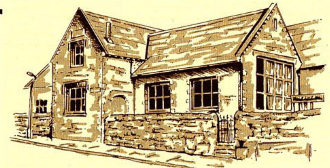
Kingsthorpe Youth Centre

The living environment of High Street and Manor Road has been steadily eroded in recent years by traffic using the streets as a short-cut or rat-run, avoiding the heavily congested centre of Kingsthorpe. The Council is committed to the alleviation of this problem and to contain traffic volumes in the Conservation Area to predominantly local users.